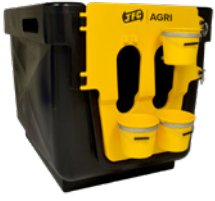
Large Calf Crib CC-02 £449