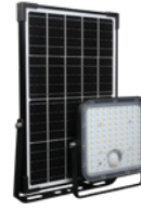
Helios 30W Solar Floodlight SOLAR-03 £91.99