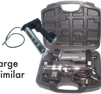
Nicad 12v Battery Operated Grease Gun £110.00